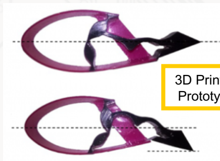
3D Printed Prototype

Optimal Design of a Hyper-Elliptic Cambered Wing